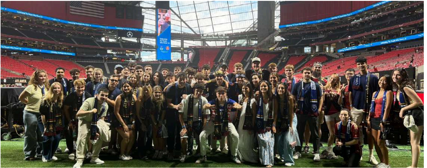
Emory Inbound BBA Exchange Class Fall '25