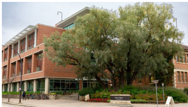
Arthur V. Mauro Residence Single room in two-bedroom suite with washroom; optional meal plan

Historically, the majority of exchange students have lived in Arthur V. Mauro.